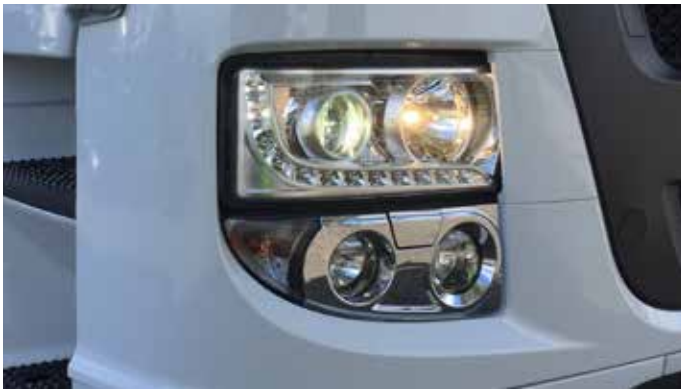
Xenon headlight + Headlamp washers