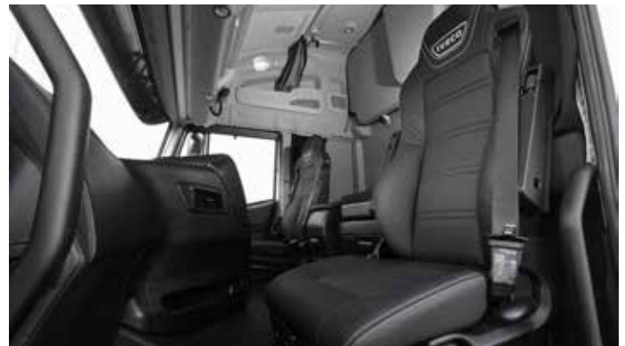
Stralis X-Way AS-L Rigid interior