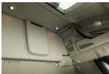
Stralis X-Way sleeper cab interior