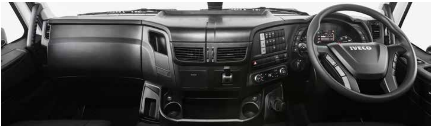
Stralis X-Way AT Rigid dash