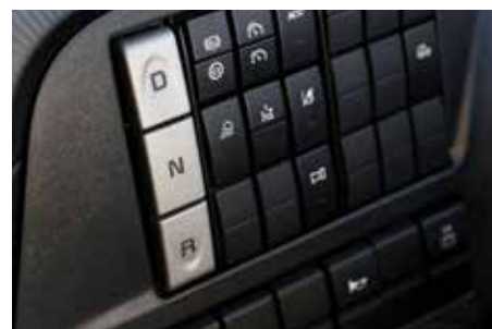
Stralis X-Way dash