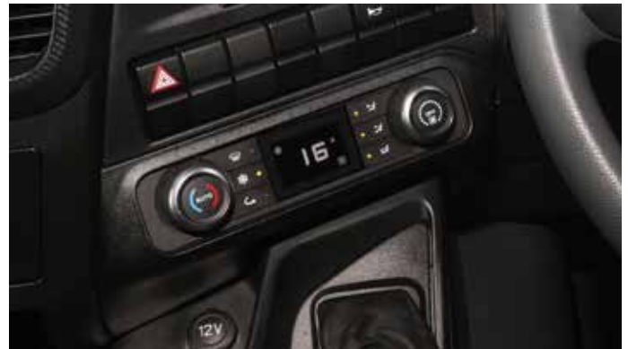
Auto a/c system