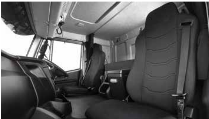
Stralis X-Way AT Rigid interior