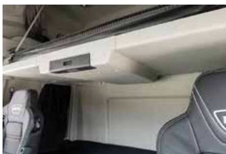
Stralis X-Way sleeper cab interior