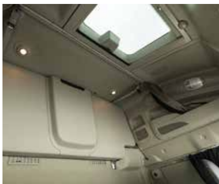
Stralis X-Way sleeper cab interior