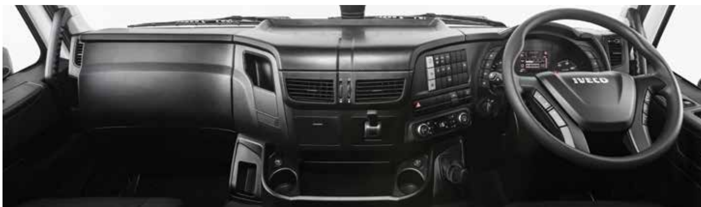
Stralis X-Way AT Prime Mover dash