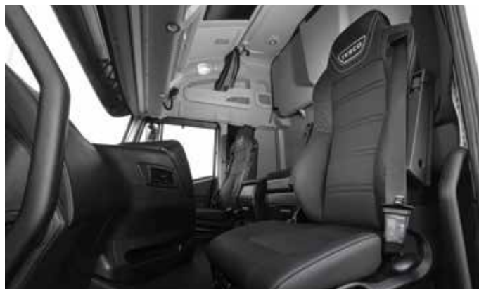
Stralis X-Way AS-L Prime Mover interior