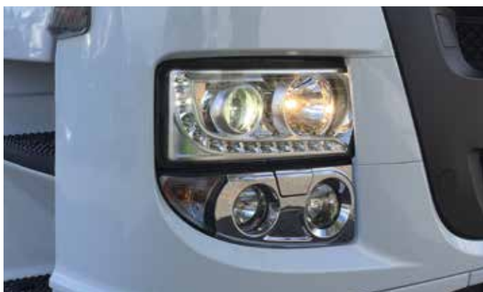
Xenon headlight + Headlamp washers