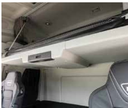
Stralis X-Way sleeper cab interior