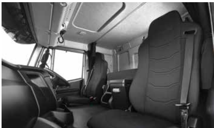
Stralis X-Way AT Prime Mover interior