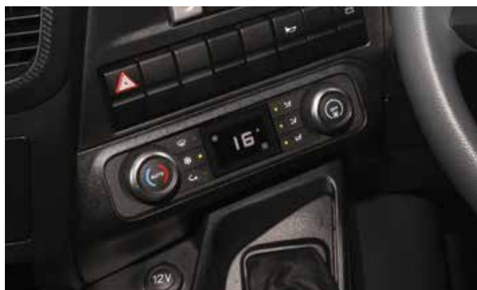
Auto a/c system