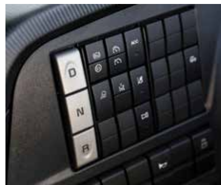
Stralis X-Way dash